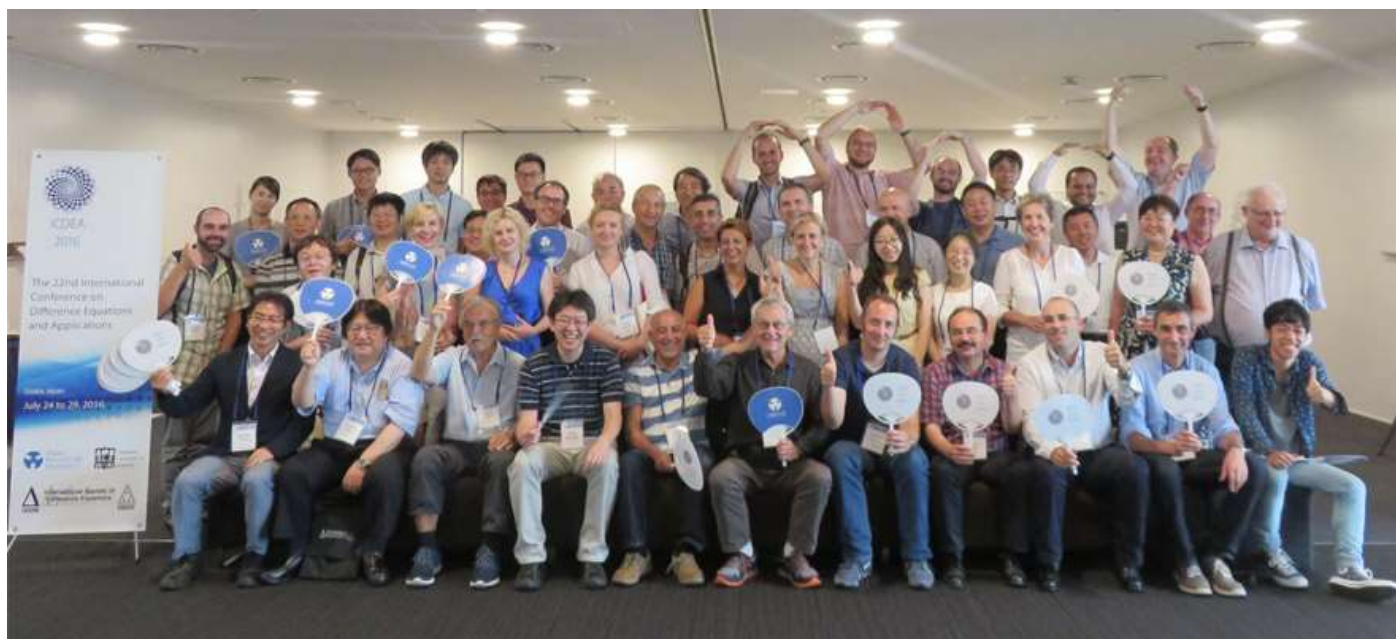
Group picture, ICDEA 2016, Osaka (Japan),

The 22nd International Conference on Difference Equations and Applications took place at the Osaka, Japan, from July 24 to 29, 2016. The conference was organized by Osaka Prefecture University (OPU), under the auspices of the International Society of Difference Equations (ISDE) and Okayama University of Science (OUS).